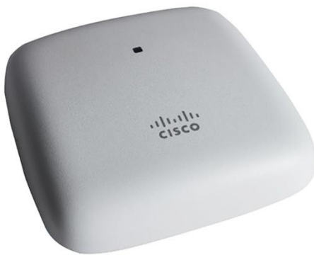
Figure 1. Cisco Aironet 1815i Access Point

The 1815i extends support to a new generation of Wi-Fi clients, such as smartphones, tablets, and high-performance laptops that have integrated 802.11ac Wave 1 or Wave 2 support.