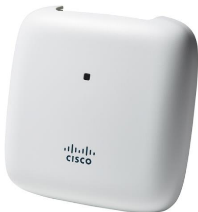
Figure 1. Cisco Aironet 1815m

With the increased coverage area, 802.11ac Wave 2 support, and the functions and features of an enterprise-level access point, the 1815m fully meets the growing requirements of wireless networks by delivering a better user experience (Figure 1).