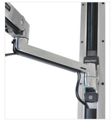
RECOMMENDED: ATTACH WALL MOUNT ARM TO AN ERGOTRON WALL TRACK USING BRACKET (97-091)