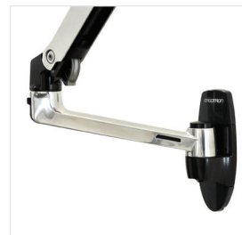
LX EXTENSION INCREASES REACH BY 9" (23 CM) POLISHED ALUMINUM (45-289-026) MATTE BLACK (45-289-224)