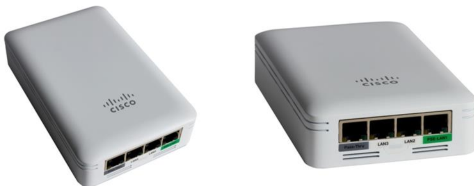
Figure 1. Cisco Aironet 1815w Access Point

Packing 802.11ac Wave 2 wireless support and Gigabit Ethernet wired connectivity into a sleek device, the 1815w is built to take full advantage of existing cabling infrastructure while blending into the visual footprint. This combination provides best-in-class performance while reducing total cost of ownership.