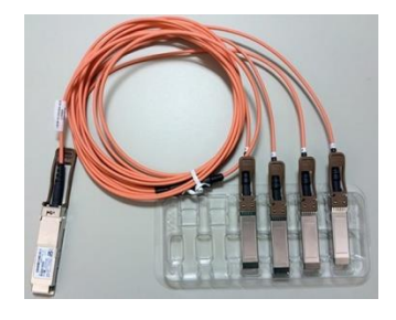
Figure 5. Cisco 40G QSFP to Four SFP+ breakout active optics cables

Cisco QSFP to four SFP+ active optical breakout cables (Figure 4) are suitable for very short distances and offer a flexible way to connect within racks and across adjacent racks. Active optical cables are much thinner and lighter than copper cables, which makes cabling easier. Active optical cables enable efficient system airflow and have no Electro Magnetic Interference (EMI) issues, which is critical in high-density racks. These breakout cables connect to a 40G QSFP port of a Cisco switch on one end and to four 10G SFP+ ports of a Cisco switch on the other end. Cisco currently offers active optical breakout cables in lengths of 1, 2, 3, 5, 7, and 10 meters.