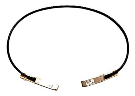
Figure 2. Cisco 40GBASE-CR4 QSFP direct-attach copper cables

Cisco QSFP to QSFP copper direct-attach 40GBASE-CR4 cables (Figure 3) are suitable for very short distances and offer a very cost-effective way to establish a 40-gigabit link between QSFP ports of Cisco switches within racks and across adjacent racks. Cisco currently offers passive cables in lengths of 0.5, 1, 2, 3, 4 and 5 meters and active cables in lengths of 7 and 10 meters.