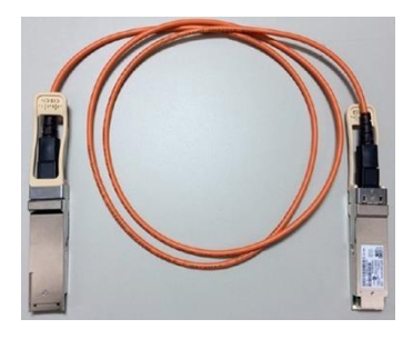
Figure 4. Cisco 40G QSFP active optics cables

Cisco QSFP to QSFP copper direct-attach 40GBASE-CR4 cables (Figure 5) are suitable for very short distances and offer a flexible way to connect within racks and across adjacent racks. Active optical cables are much thinner and lighter than copper cables, which makes cabling easier. Active optical cables enable efficient system airflow and have no EMI issues, which is critical in high-density racks. Cisco currently offers active optical cables in lengths of 1, 2, 3, 5, 7, 10, 15, 20, 25 and 30 meters.