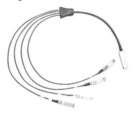
Figure 3. Cisco QSFP to Four SFP+ copper breakout cables

Cisco QSFP to four SFP+ copper direct-attach breakout cables (Figure 2) are suitable for very short distances and offer a very cost-effective way to connect within racks and across adjacent racks. These breakout cables connect to a 40G QSFP port of a Cisco switch on one end and to four 10G SFP+ ports of a Cisco switch on the other end. Cisco currently offers passive cables in lengths of .5, 1, 2, 3, 4 and 5 meters and active cables in lengths of 7 and 10 meters.