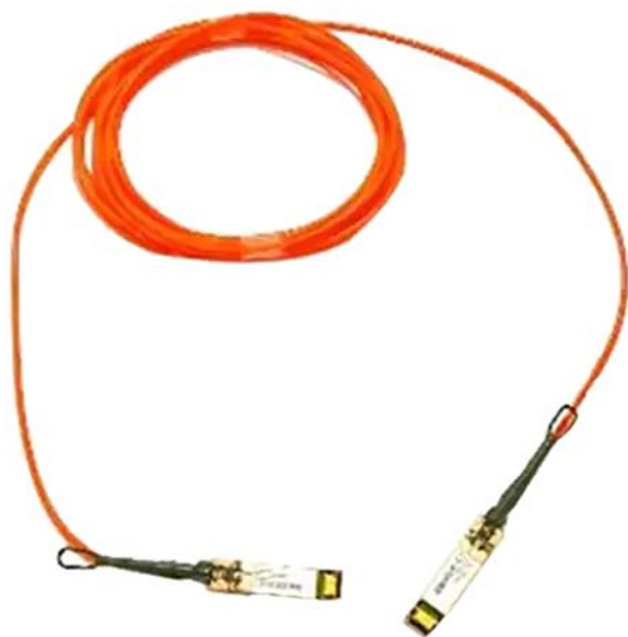
Figure 5. Cisco direct-attach active optical cables with SFP+ connectors

Cisco SFP+ Active Optical Cables (Figure 5) are direct-attach fiber assemblies with SFP+ connectors. They are suitable for very short distances and offer a cost-effective way to connect within racks and across adjacent racks. Cisco offers Active Optical Cables in lengths of 1, 2, 3, 5, 7, and 10 meters.