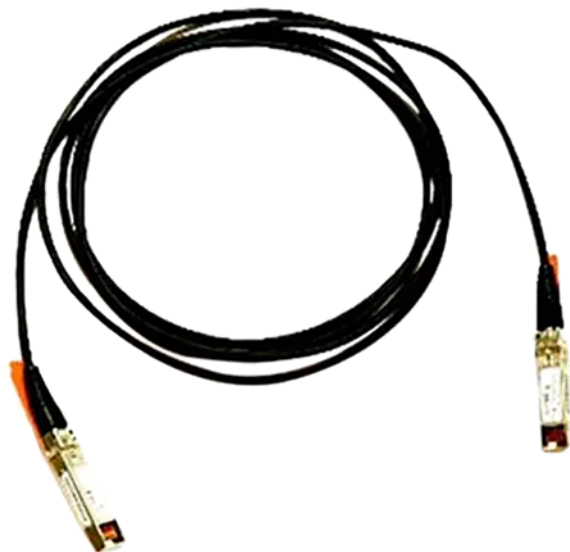
Figure 4. Cisco direct-attach twinax copper cable assembly with SFP+ connectors

Cisco SFP+ Copper Twinax (Figure 4) direct-attach cables are suitable for very short distances and offer a cost-effective way to connect within racks and across adjacent racks. Cisco offers passive Twinax cables in lengths of 1, 1.5, 2, 2.5, 3, 4 and 5 meters, and active Twinax cables in lengths of 7 and 10 meters.