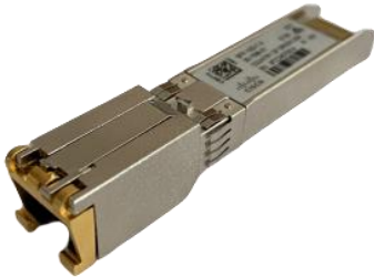
Figure 2. Cisco SFP+ 10GBASE-T module with RJ-45 connector

The Cisco 10GBASE-T module (Figure 2) offers connectivity options at the following data rates: 100M/1G/10Gbps. It has the SFP+ form factor and an RJ-45 interface so that CAT5e/CAT6A/CAT7 cables can be used to connect to end points with embedded 10GBASE-T ports. They are suitable for distances up to 30 meters and offers a cost-effective way to connect within racks and across adjacent racks.