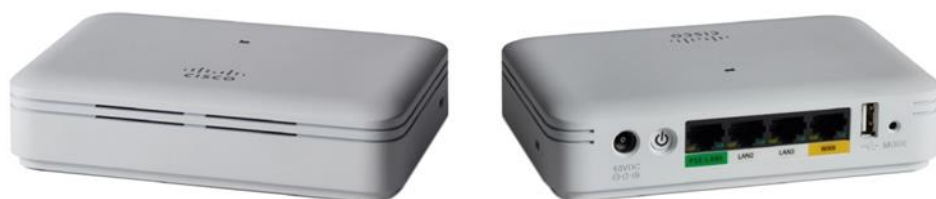
Figure 1. Cisco Aironet 1815t Access Point

The Cisco® Aironet® 1815t Access Point (Figure 1) offers a highly secure enterprise wired and wireless connection to the home, micro-branch, or any type of remote sites. No longer will geography or the elements play a role in delaying productivity, as the 1815t extends the corporate network to teleworkers, mobile workers, and even micro-sites. The access points connect to the home or on-site broadband Internet access and establish a highly secure tunnel to the corporate network. This tunnel allows remote employees access to data, voice, video, and cloud services for a network experience consistent with that at the corporate office. The 1815t supports highly secure access to corporate data and personal connectivity for teleworkers' home devices, with segmented home traffic.