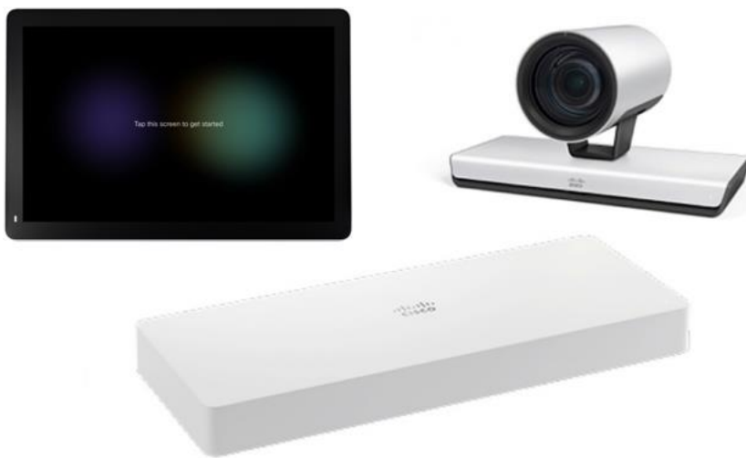
Figure 1. Cisco Webex Room Kit Plus Precision 60 integrator package

The Room Kit Plus P60 integrator package is rich in functionality and experience but is priced and designed to be easily scalable to all of your collaboration spaces – whether registered on the premises or to Cisco Webex in the cloud.