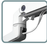
CABLES ROUTE BENEATH THE ARM, OUT OF THE WAY